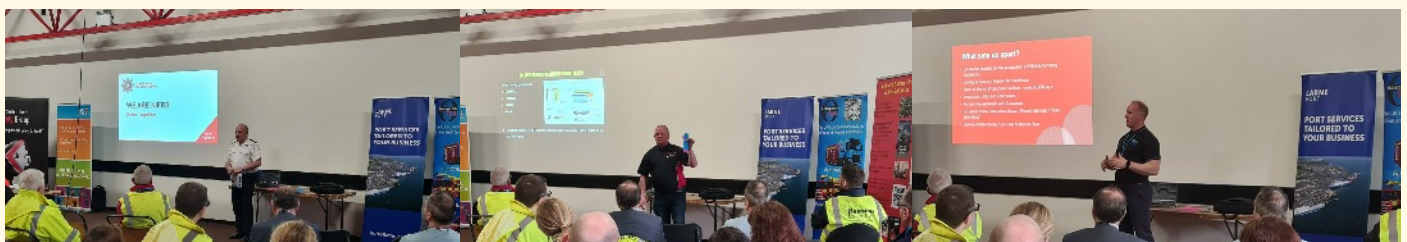
All three presenters take it in turns to talk about different aspects of lithium battery fires