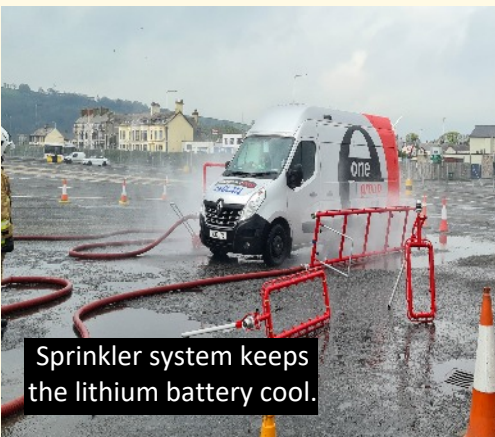
Sprinkler system keeps the lithium battery cool.

Are you following us on Social Media? You can find us on Facebook, LinkedIn, Twitter, or have you signed up for our E Zines? For any further information drop us an email to info@niscg.org.uk or admin@niscg.org.uk .